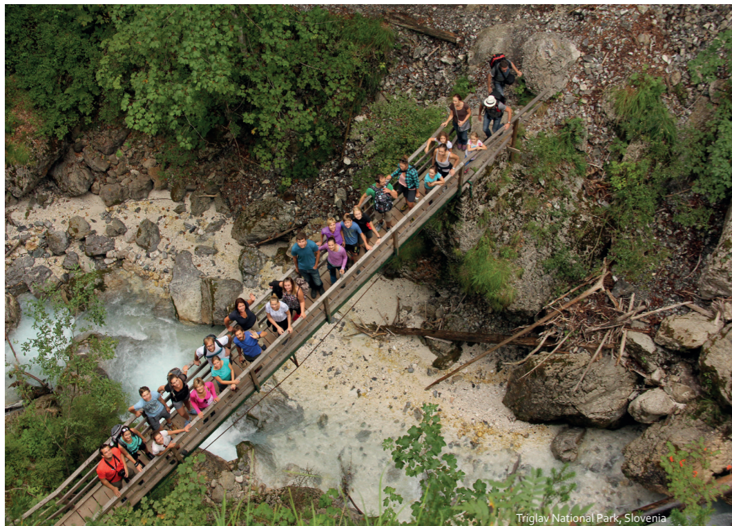
Triglav National Park, Slovenia

The application procedure is based on submission of documents via the online application tool on the homepage www.cuas.at/mca (supporting materials, a full CV, a letter of motivation and two reference letters) and a subsequent oral interview (personal, skype).