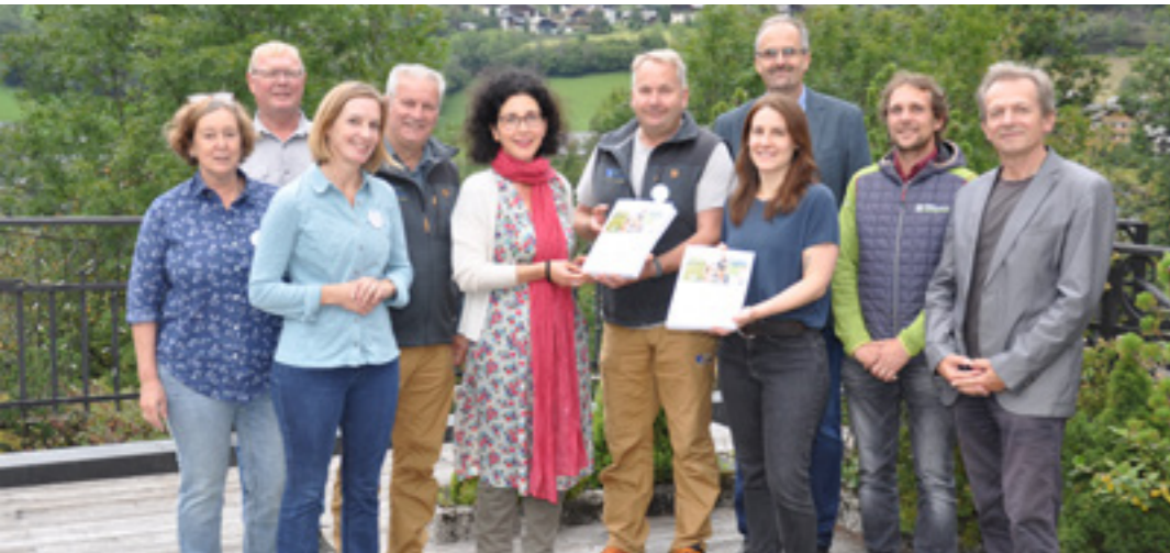
Handing over the 10-year evaluation report