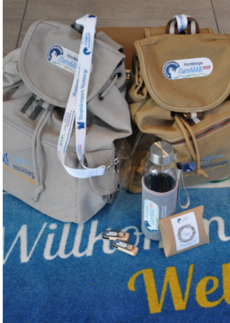
Well-equipped through the conference

border cooperation between societies and generations." This cross-border cooperation between societies and generations, as practised in the Nockberge Biosphere Reserve, is reflected in the close cooperation with the Triglav National Park in Slovenia and the Prealpi Giulie Nature Park in Italy.