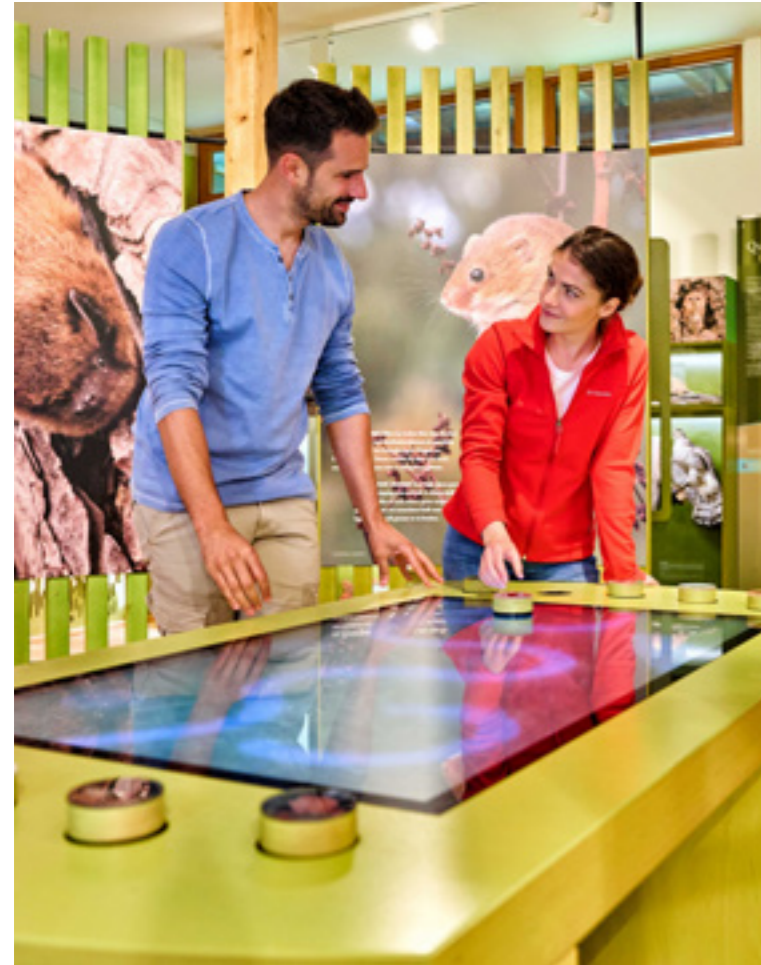
Exploring the UNESCO Biosphere Reserve Mittelalpe