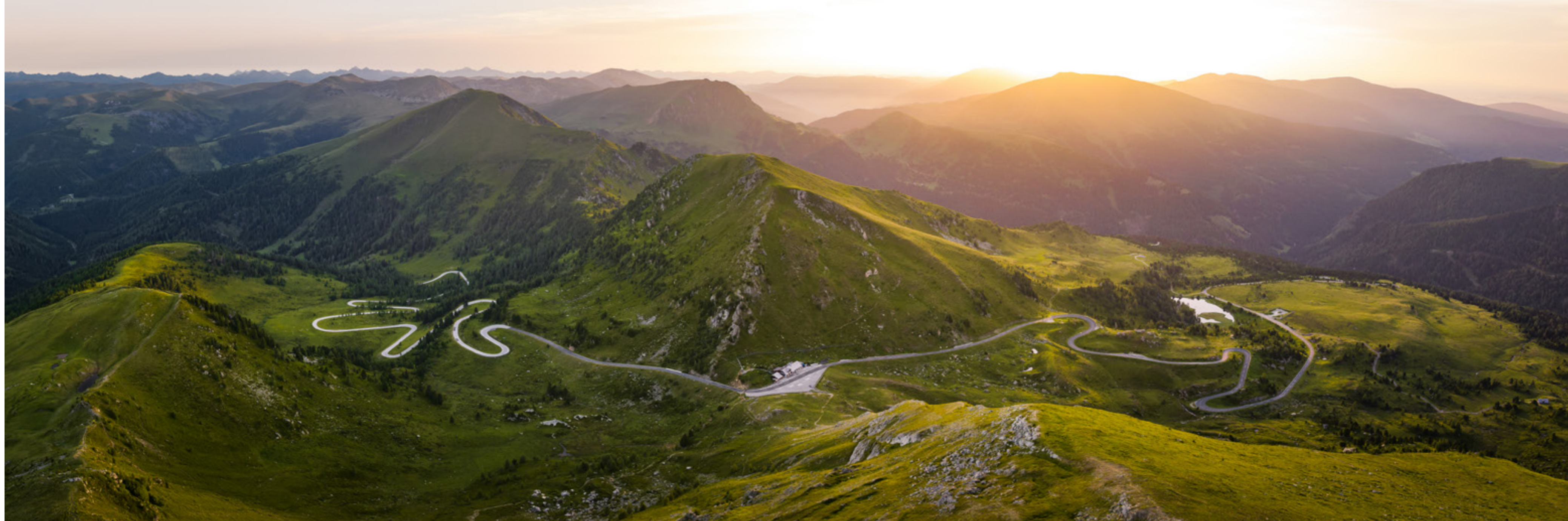
The Nockalm roads leads trough the Salzburger Lungau & Kärntner Nockberge Biosphere Reserve