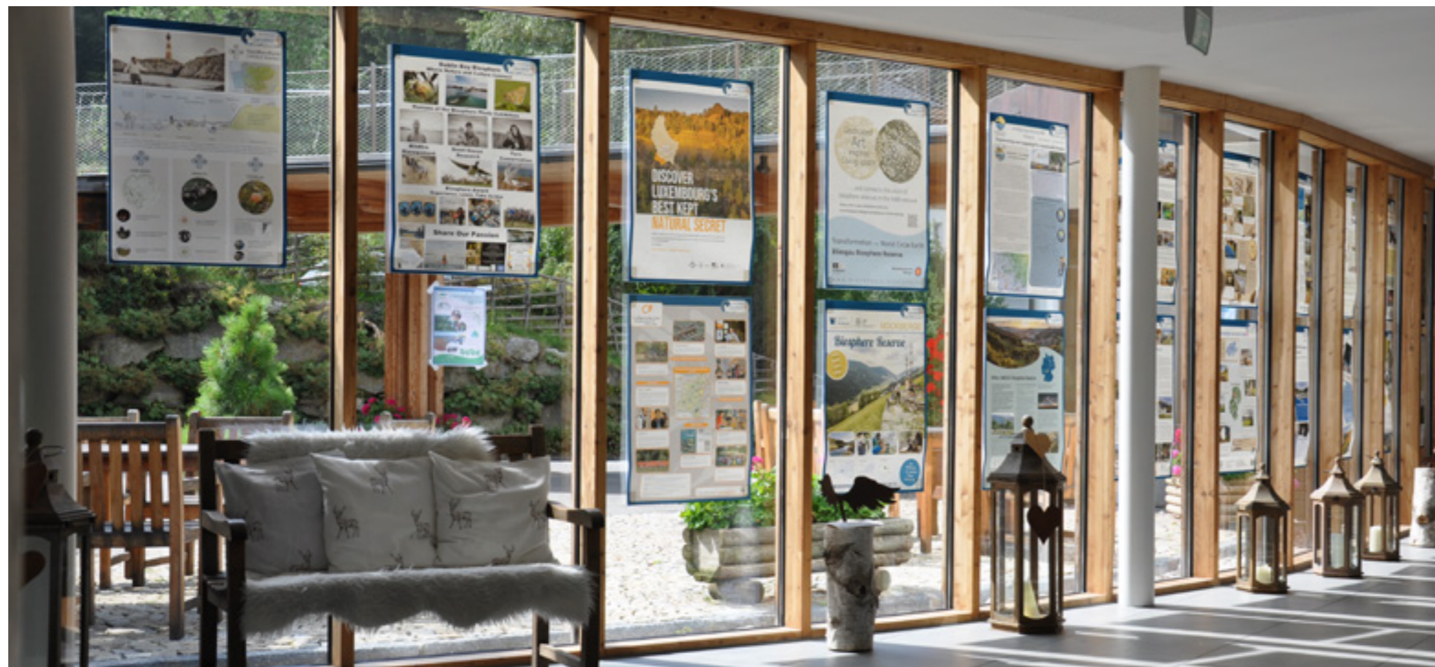
Poster display at EuroMAB conference

THE FOLLOWING PICTURES GIVE AN INSIGHT INTO THE POSTER EXHIBITION AND SHOW EXCERPTS OF THE EVENT.